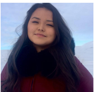
Tooma Laisa Children's Song App